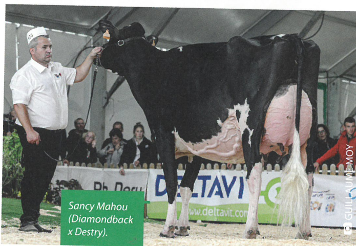
Sancy Mahou (Diamondback x Destry).